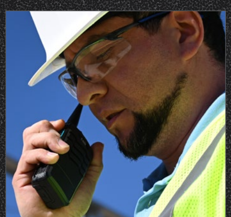
Construction crews hear instructions loud and clear using digital DMR technology.